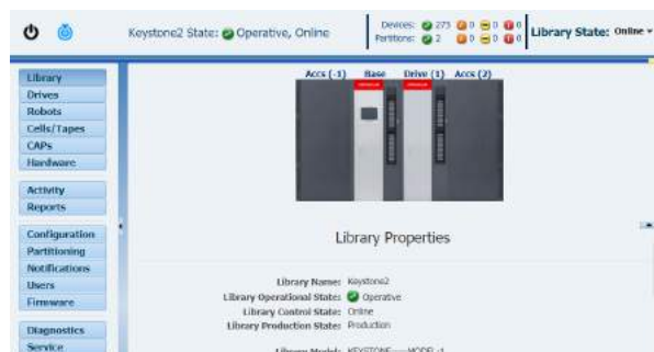
Figure 1: StorageTek SL4000 modular library system integrated UI

Lower your administrative burden with an intelligent approach to storage management. The StorageTek SL4000 modular library system offers the most flexible solution for managing, monitoring, partitioning, and sharing library resources. The rich management interface provides an in-depth look into library operations. It also provides support for four user roles, including read-only, to improve security. Proactive email alerts can be set up based on the tracking of all actions initiated within the system by users and applications. Email alerts can be set up to provide proactive notification of library events.